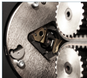
High precise rotary incision unit based on industry leading Schleuniger technology