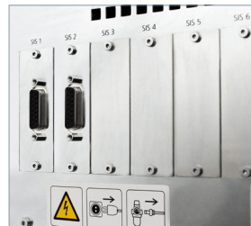
Modularly designed interfaces for full range of accessories, including prefeeders, marking systems, coilers, stackers and custom devices