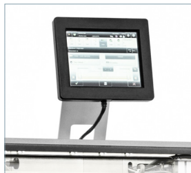
5.7" color touch screen with S.On software for intuitive navigation and library based programming