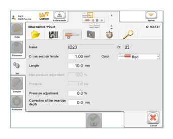
The graphic HMI provides the operator with a clear and well-arranged display of all relevant information. The ferrules are displayed in their corresponding standard color.