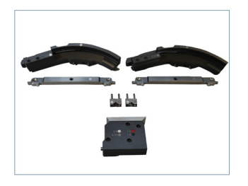
Color-coded interchange parts in accordance with the standard specifications facilitate and accelerate correct setup.