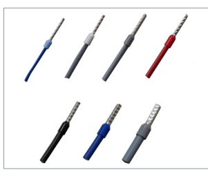
Reliable and fast processing of different ferrules thanks to software-controlled crimp force adjustment to the respective conductor cross-section.